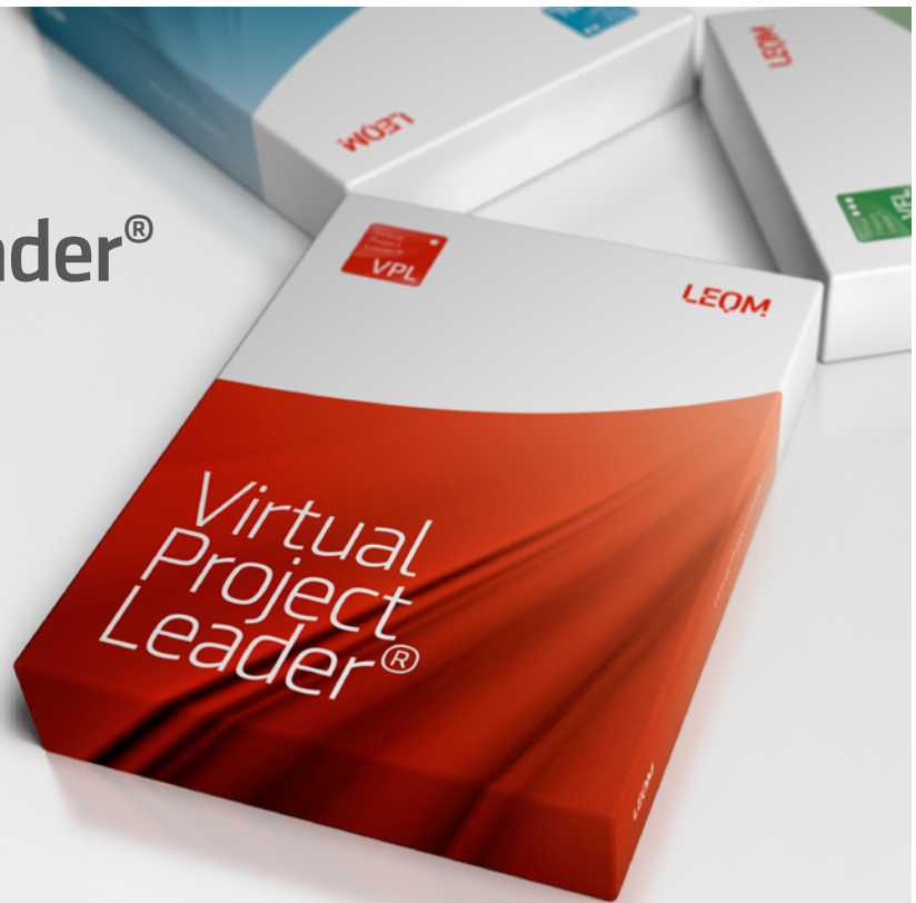
Product Development Process

VPL® offers personal decision support in form of dashboards and deviation reports, always available in real time. These can be tailored quickly and easily to each function and user. VPL® allows you to easily import and analyze complex supplier plans. The status will automatically be visualized and any deviations directly identified.